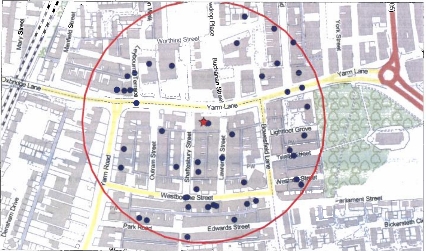
Map 1: 200m radius of 53 Yarm Lane, Stockton

Statistics: 57 offences and 29 anti-social behaviour incidents linked to alcohol within the 200m radius. Average of 4.8 crimes and 2.4 incidents per month; crime peaks in June and July. Crime is showing a decreasing trend and incidents a slight increasing trend.